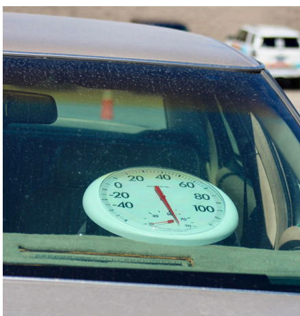
Temperatures rise rapidly in parked cars