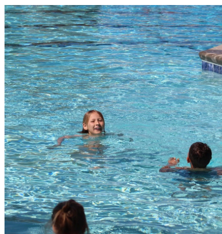
Remember to Patrol, Protect and Prepare